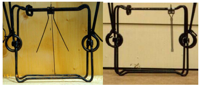
Figure 2. Standard V-trigger conibear trap and modified conibear trap.

Objective D: Evaluate the feasibility of allowing a limited amount of harvest by trappers in the future as populations become more established and widespread in the State