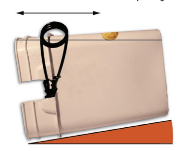
Tilt the trap so bait cannot be seen from above.